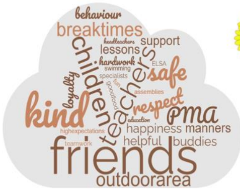
What makes our school exemplary? Pupils' responses.