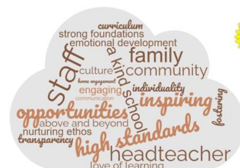
What makes our school exemplary? Parent responses.

The post box will be found in the main reception area if anyone would like to bring in Christmas cards to be delivered. Please remember to write the full name and class on the envelope.