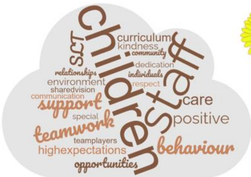
What makes our school exemplary? Staff responses.