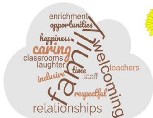
What makes our school exemplary? Governors' responses.