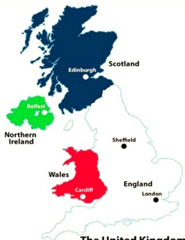
The United Kingdom UK countries and capital cities