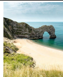
Examples of physical features: Mount Snowdon; Jurassic Coast