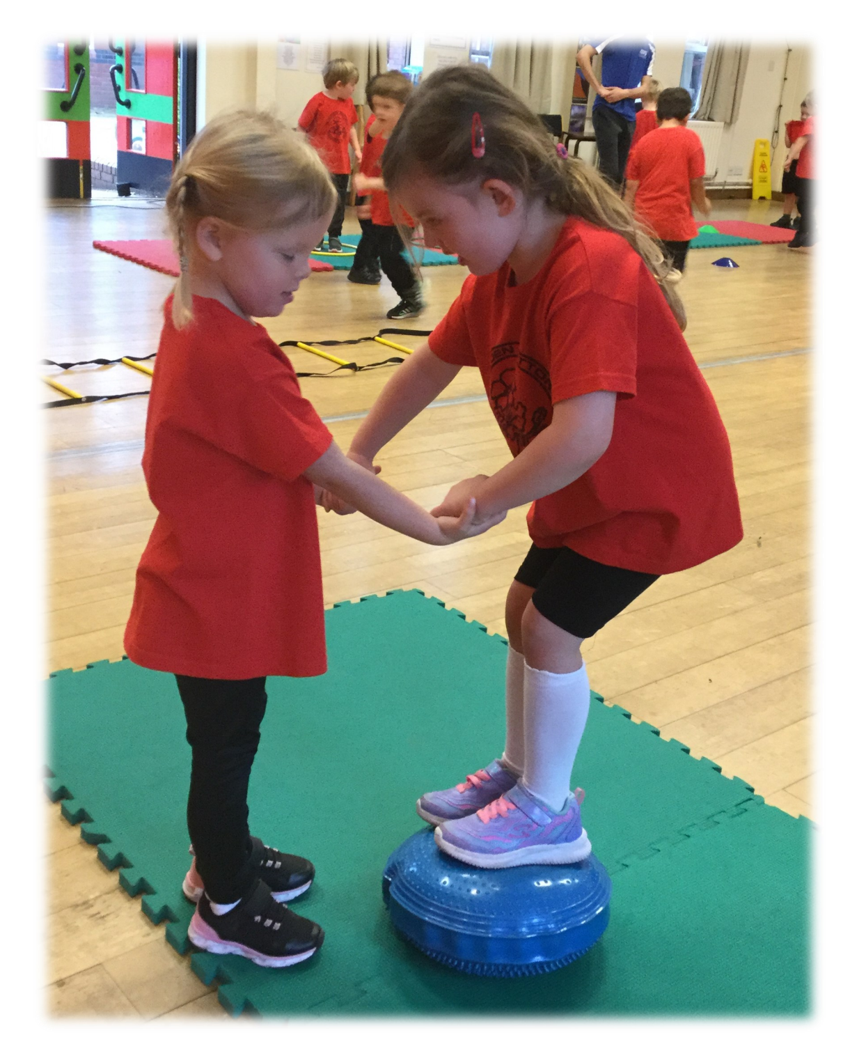
'A small school with a big heart.'